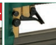
Versione V - V model