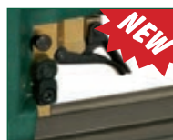
Versione SL VL SL VL model