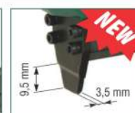
Versione NF - NF model