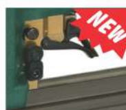
Versione SL VL SL VL model