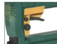
Versione V - V model