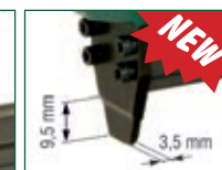
Versione NF - NF model