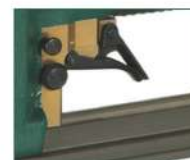
Versione V - V model