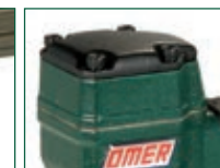
Versione H - H model