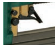
Versione V - V model