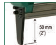
Versione SL - SL model