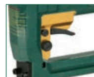
Versione V - V model