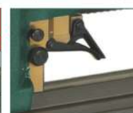
Versione V - V model