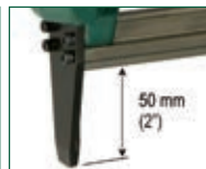
Versione SL - SL model