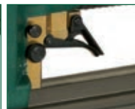
Versione V - V model