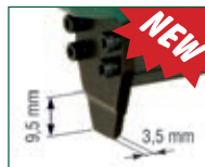
Versione NF - NF model