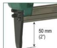
Versione SL - SL model