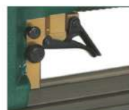
Versione V - V model