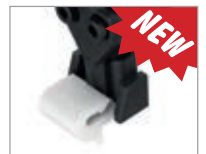
Versione 104 (Fissaggio clip) 104 version (Clip Fixing)