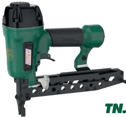
TN.715 - TN.732