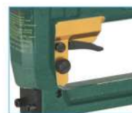
Versione V - V model