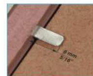
Costruzione cornici Picture frame manufacture