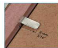
Costruzione cornici Picture frame manufacture