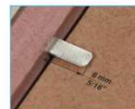
Costruzione cornici Picture frame manufacture